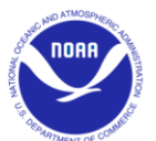
Figure 2. Lubbock, TX National Weather Service Forecast Office website recognition of coldest known temperatures across Texas: http://www.srh.noaa.gov/lub/?n=wwad-coldestintexas